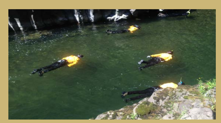
Downstream snorkel surveys on the Chehalis River