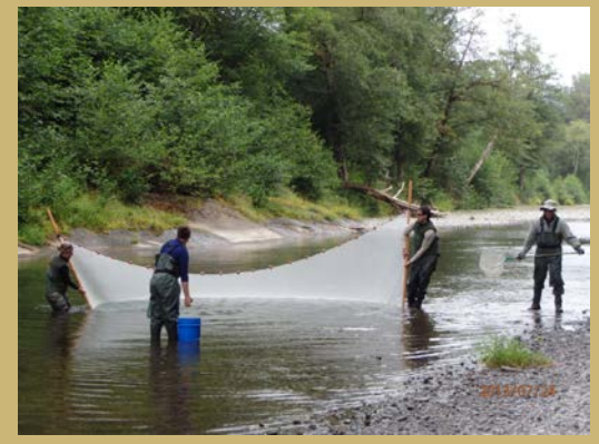
Seine collections of fish in the Chehalis River