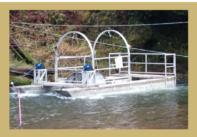
Chehalis River smolt trap is operated near river mile 108