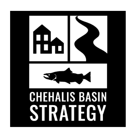
Horizontal With Text