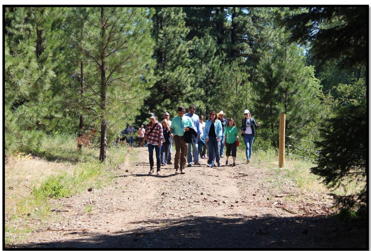
Teanaway Community Forest