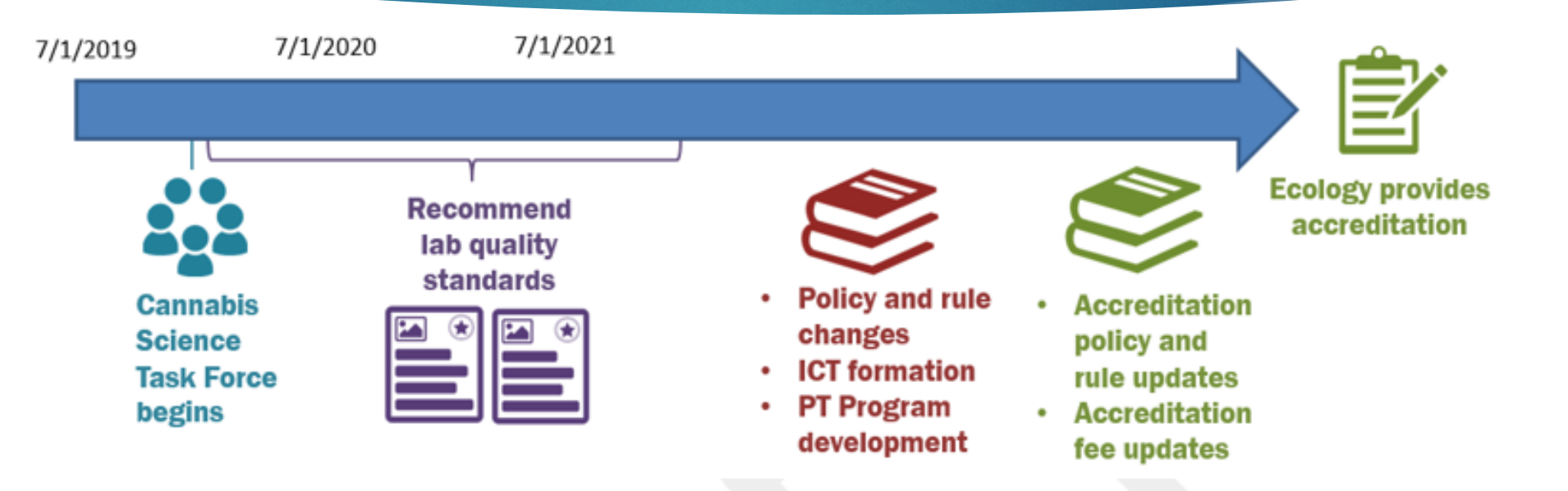
Figure 2. Task Force events timeline and next steps.