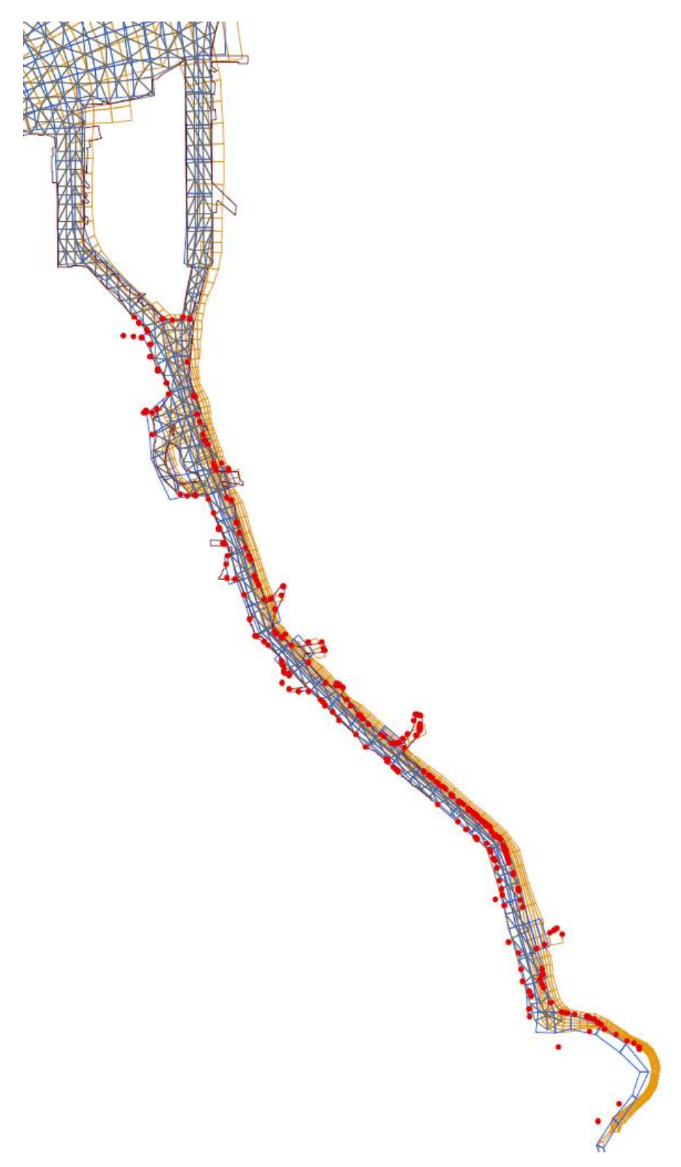
Figure 2. LDW Outfalls