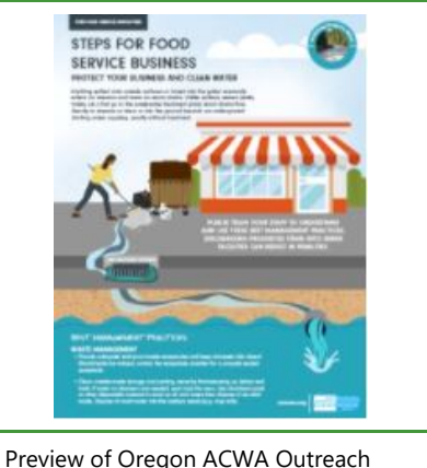
Preview of Oregon ACWA Outreach Handout for the Food Service Business, Available to Members Only

Materials aimed at single-family homeowner education will not be included in the Online Resource Library, although materials that are applicable to multi-family residential