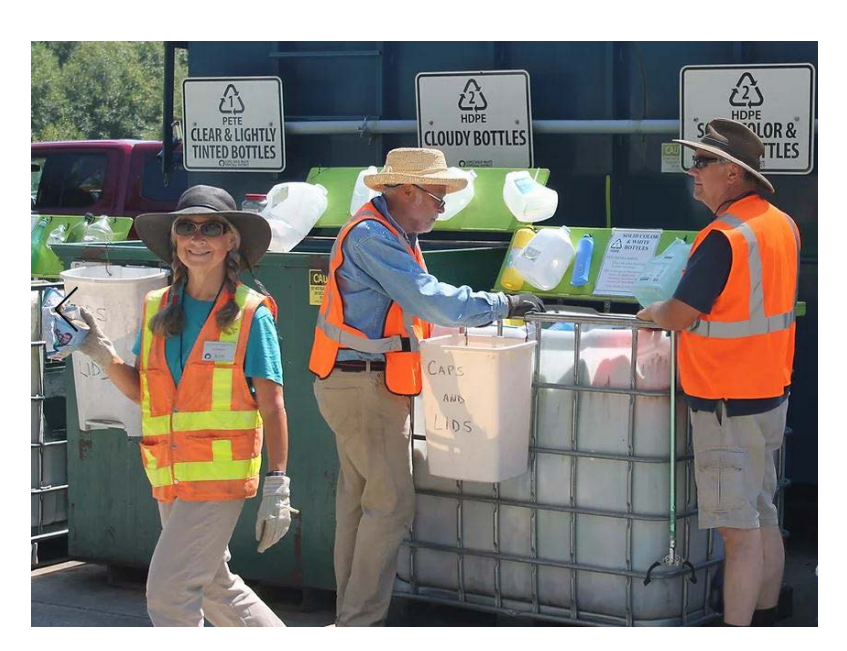
Figure 2: Lopez Solid Waste Disposal District uses actual recyclables to create 3D signage at their drobox locations.