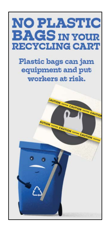
Figure 1: Samples of Spokane's contamination reduction campaign, including postcards, FAQs, and more are in the local programs section of the Resource Library.