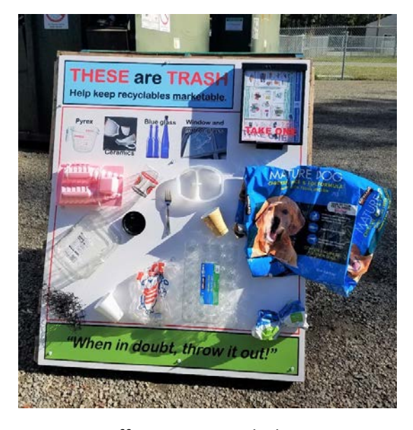
Figure 5: Jefferson County drobox signage includes actual examples of acceptable and unacceptable materials. Find more information in the local programs section of the Resource Library.