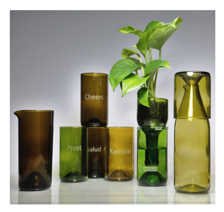
Figure 8: Refresh Glass is on a mission to rescue 10 million bottles from disposal by transforming wine bottles into exquisite glassware. As of August 6, 2020, they've rescued 1,613,747 bottles and counting.

Refresh Glass – Refresh Glass upcycles wine bottles into beautiful glassware and other products used in restaurants around the world. In this presentation, Ray DelMuro, the founder of Refresh Glass profiles his company, the new products he's launching soon.