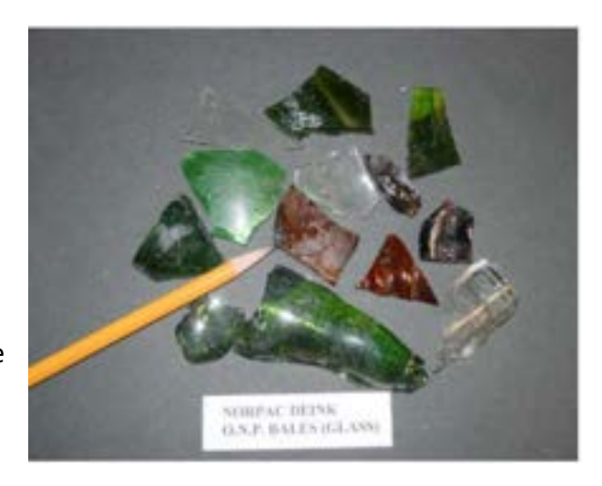
Figure 6: Glass collected in commingled recycling programs can end up at paper mills and seriously damage papermaking equipment. This 2009 photo shows glass that was in a paper bale and rejected in the pulping process at NORPAC.