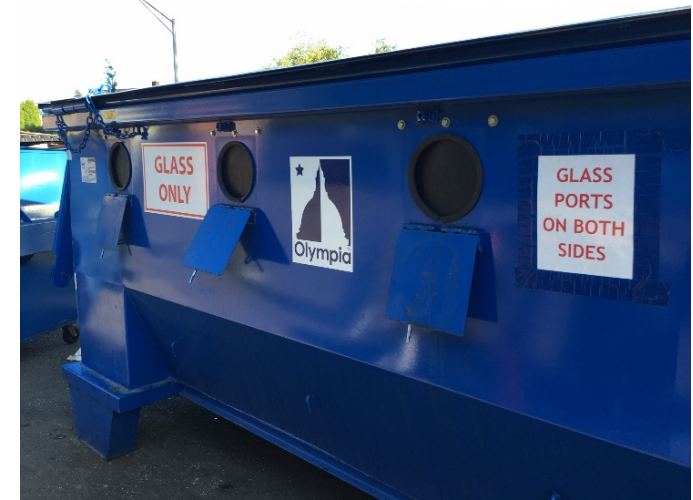
Figure 7: City of Olympia removed glass from their commingled residential recycling program in 2020 to reduce cross-contamination of the others materials they collect. They now provide glass recycling at drop off sites around the city.

What type of processing system do you operate for glass? (Single-stream, colorseparated, dual-stream, etc.)