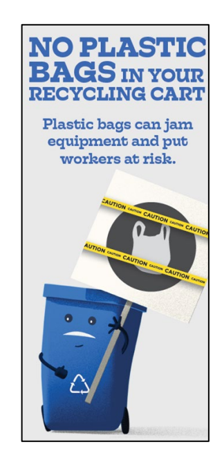
Figure 19: Samples of Spokane's contamination reduction campaign, including postcards, FAQs, and more are in the local programs section of the Resource Library.

These resources from <u>The</u> Recycling Partnership provide steps and tools to improve the quality of your recycling program.