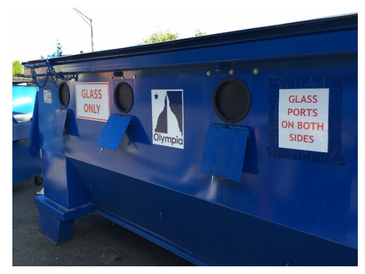
Figure 25: City of Olympia removed glass from their commingled residential recycling program in 2020 to reduce cross-contamination of the others materials they collect. They now provide glass recycling at drop off sites around the city.

If the answers to these questions demonstrate there are not viable markets and/or the cost is too high to collect glass for recycling, consult NERC's Glass Recovery Hierarchy for options other than disposal.