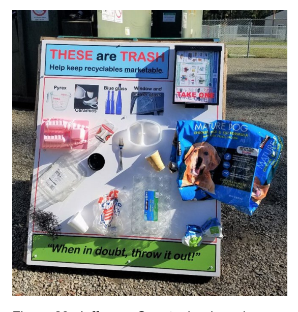
Figure 23: Jefferson County dropbox signage includes actual examples of acceptable and unacceptable materials. Find more information in the local programs section of the Resource Library.