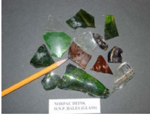
Figure 24: Glass collected in commingled recycling programs can end up at paper mills and seriously damage paper-making equipment. This 2009 photo shows glass that was in a paper bale and rejected in the pulping process at NORPAC.