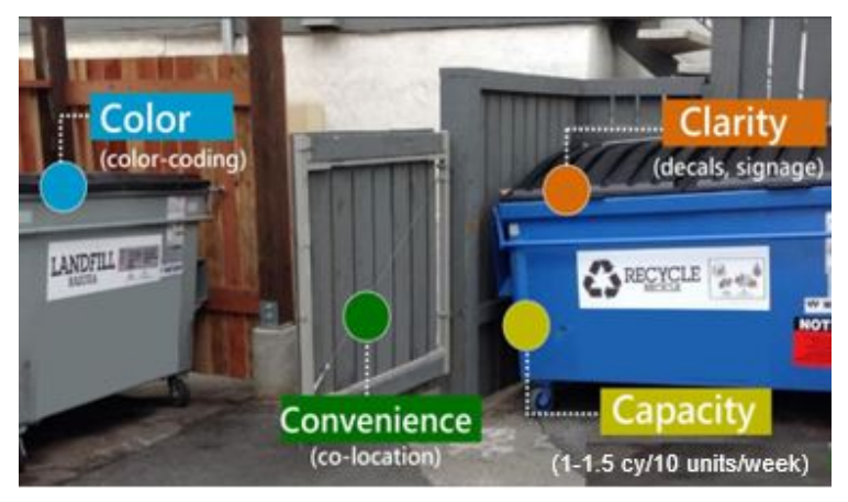
Figure 21: Dropbox, commercial, and multi-family collection programs should consider the 4 C's (Capacity, Convenience, Color, and Clarity). from <u>Cascadia Consulting – 2019 Role of Recycling Policy and Code presentation</u>