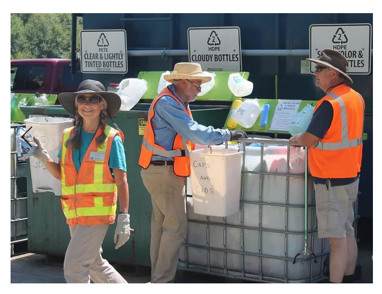
Figure 20: Lopez Solid Waste District uses actual recyclables to create 3D signage at their dropbox locations.