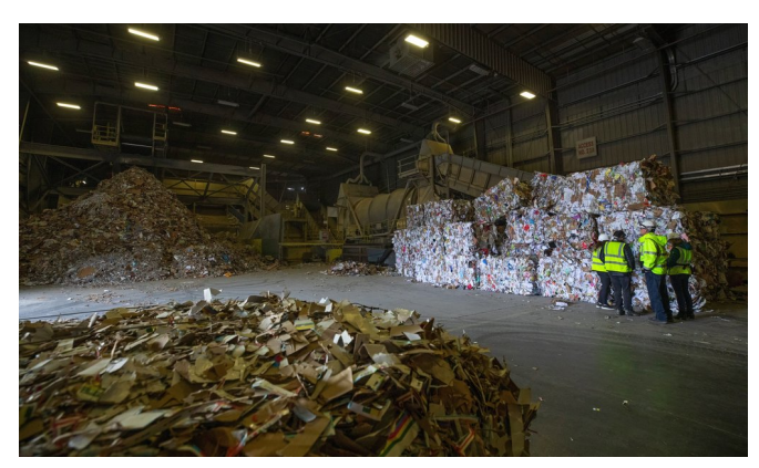
Bales of mixed paper and cardboard sit in a huge building at NORPAC in Longview before they are processed in a pulping vat and turned into paper, paper bags and liner board for boxes. Garbage is... More >

In a cavernous building where bales are stacked before processing, Simmons and Rozwood point out flattened milk jugs, tattered plastic bags and chunks of Styrofoam mixed in with the paper. They've also found lengths of garden hose, twisted chairs and even a teddy bear. All that garbage has to be removed — and the first step occurs inside a pulping vat that resembles a giant, front-loader washing machine. The paper is turned into a slurry and the trash is screened out and ejected, then piled up for transport to a local landfill.