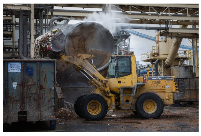
A heavy-equipment operator picks up garbage ejected from the pulping vat at NORPAC in Longview. The garbage was mixed in with the paper and cardboard that are being recycled. Twenty truckloads of... More V

But NORPAC is facing the same dirty truth about contamination that was so vexing to the Chinese.