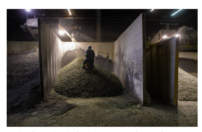
A worker at Strategic Materials in Seattle plucks contaminants from a pile of sorted, processed glass fragments, called cullet. Strategic Materials cleans, sorts and tumbles crushed glass,... More V

While U.S. cities cut back on recycling, B.C. has been expanding — even tapping a dedicated research fund to figure out how to recycle single-use coffee pods. "We collect more types of materials than anyone else," Lefebvre says. "Because we take all the material across the province, that allows us to increase the quality of our materials and to access markets." The program incentivizes curbside collection that separates glass and plastic and paper to reduce cross-contamination. The price tag averages a fraction of a cent per unit recycled, so even if manufacturers pass the cost on to consumers, the impact is negligible, he adds.