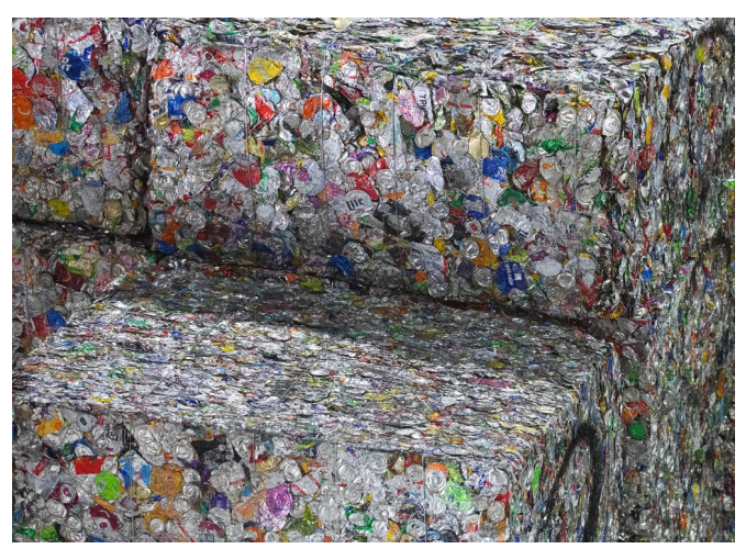
Eight hundred tons of recycling from Seattle and other cities arrive at Republic Services in Seattle every day. Aluminum cans are bundled and will be shipped to smelters in North America to be... More V

Among other improvements, they added new sorters that use near-infrared sensors and digital cameras to "pick" 1,000 bits of debris a minute, kicking out unwanted items with bursts of air. The goal is to parse the commingled materials into separate streams — paper, cardboard, PET plastics, HDPE plastics — but it remains an imperfect process.