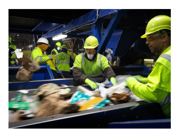
■ 1 of 30 | Pickers on the lines at Republic Services' Sodo facility pull out items that cannot be recycled.

April 26, 2020 at 7:00 am | Updated April 26, 2020 at 11:49 am