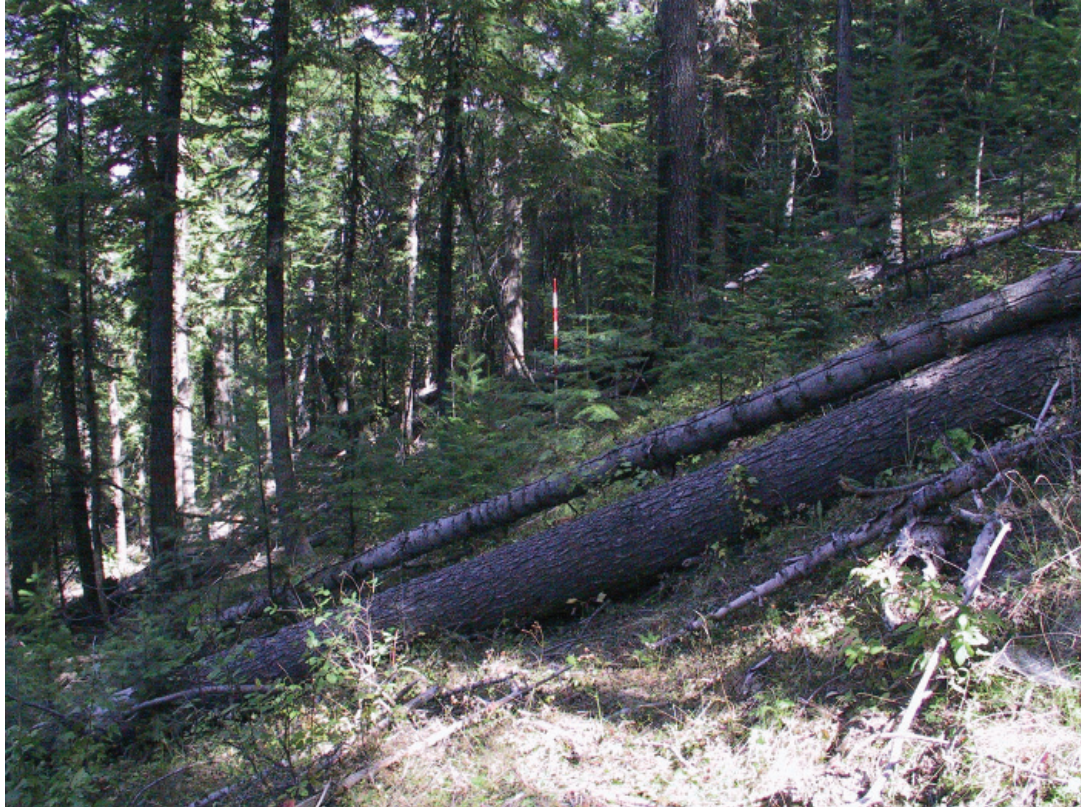
Figure 3 —Example of pre-harvest stand conditions in the Lick Creek Demonstration Site.

The existing vegetation over the site prior to treatment generally reflected a mid-successional state (Fig. 3). Most of the area supported a sparse component of 100+ year-old trees of ponderosa pine, western larch, and Douglas-fir that formed an upper overstory layer with canopy cover ranging from 5-15%. Tree heights were 90 ft with average d.b.h. ranging from 20 to 32 inches. The majority of the leave trees in the harvest treatments were in this particular cohort. The bulk of the forest canopy was a deep mid-story tree layer composed predominantly of Douglas-fir (67%) and grand fir (24%) with sparse ponderosa pine (6%) and western larch (3%). Average height of trees within this layer ranged from 45 to 50 ft and averaged 9 to 11 inches d.b.h. Most of the merchantable timber came from this mid-story layer. A distinct third cohort of smaller trees with 3 to 6 inches d.b.h. occurred in the lower portion of the layer between 20 and 40 ft. These smaller trees composed 53% of the total tree density of the layer, and in combination with an understory layer of juvenile trees less than 3 inches d.b.h. and under 10 ft in height, formed the greatest barrier to light penetration to the ground surface.