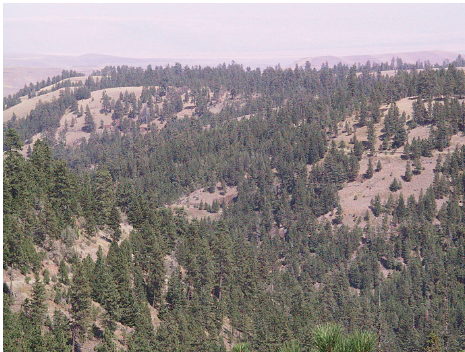
Figure 2 —Pre-harvest photograph of the Lick Creek Demonstration Site looking east along the face of the site in 2000.