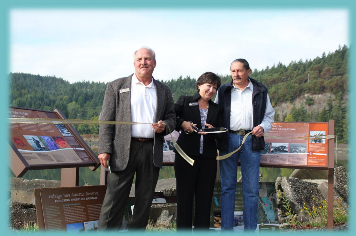
Trail Tales Sign ribbon cutting

Lummi Samish Nation Skagit Co-op Suquamish Swinomish Upper Skagit Tulalip