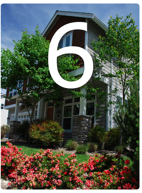
Figure 6.01 - Monroe's development patterns provide for a wide range of housing types - but housing and services aren't always within walking distance of each other, and housing types that suit downtown and close-in neighborhoods remain uncommon.

This chapter has been developed in accordance with the Washington Growth Management Act (GMA) requirements to address housing issues within Monroe's city limits and the Urban Growth Area (UGA) over the next 20 years.