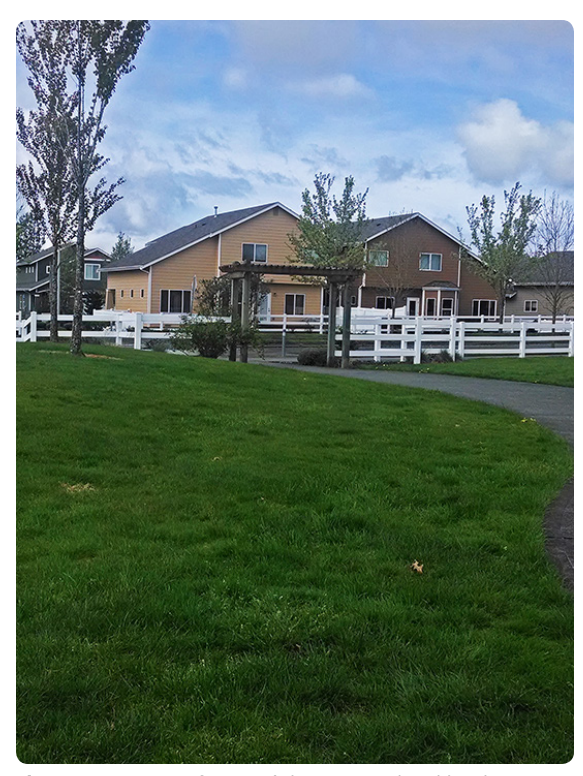
Figure 6.02 - Most of Monroe's housing stock - old and newer - enjoys close proximity to parks and open space areas.