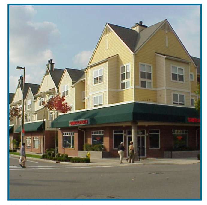
Mixed-use building in Downtown