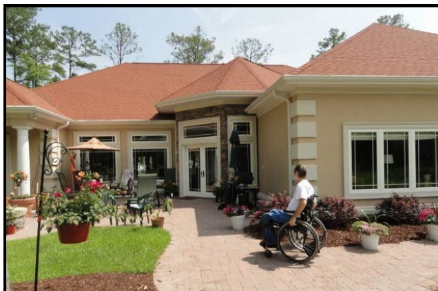
Vasey home in Myrtle Beach, S.C. built with Universal Design features, including zero-step entry and multiple smooth surface paths, lower windows and French doors.

the need for adaptation or specialized design.” There are many ways to incorporate UD into homes but examples of these concepts include: zero-step entrance at front or back door (or both), changing out the type of door knobs in a home, toilet seats with adjustable height, low slip flooring, allowing for wider door openings with a minimum of 32 inches in width, locating a half bath or full bath on the main floor, considering the senses and intuitive use when adding thermostats and designing single-story homes with no stairs.