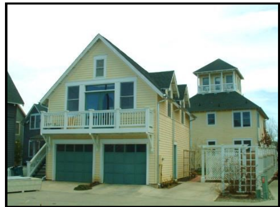
Accessory dwelling unit located above a garage. It matches the same character and design of the primary structure.

ADU's provide affordable living options in neighborhoods often times for seniors and young adults.