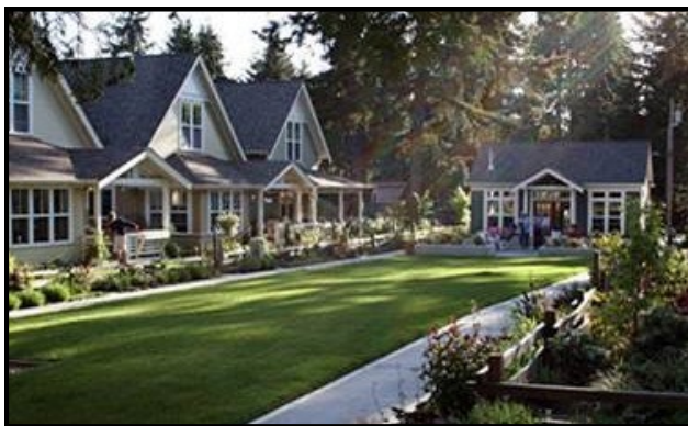
Craftsman-style cottage housing, a community building and center common area.

are the appeal. Cottage housing developments maintain a common architectural style within the project that can vary by the market, local context or developer's preference. The range of styles covers a wide range with each motif dependent on extraordinary detail, consistent form, and complementary colors for a successful project. Parking is arrayed around the site perimeter with walkways connecting to individual homes. There is often a small community building to host neighbors for casual social interactions – people choose cottage housing to develop close relations