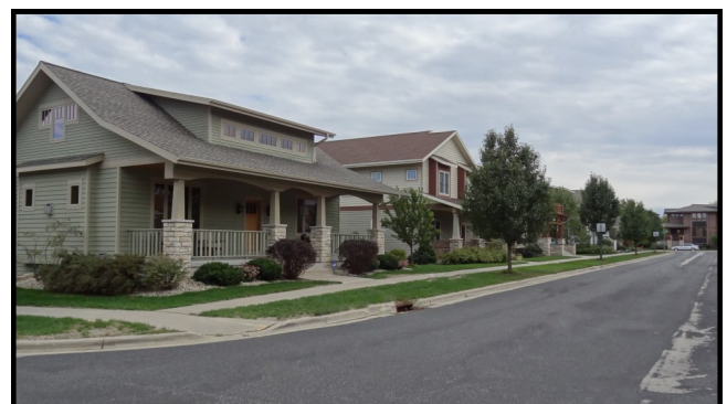
Large front porches and reduced front yard setbacks.

Varied home styles and price ranges support the needs of Sequim residents.