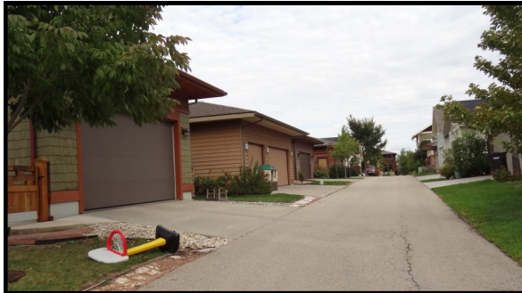
Garages located in the rear accessed by alleys.

Within the area of single family homes, design that encourages “small-town and friendly” experiences include homes with substantial front porches, garages in the rear accessed from alleys and reduced front yard setbacks. These homes accommodate a range of residential needs for young adults, families and senior citizens.