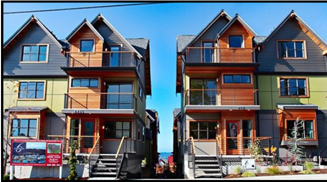
Three-story townhomes with reduced front setbacks, small lots and similar style facades.

Encourage townhomes in the Downtown District, the Lifestyle District and in areas surrounding Sequim’s Downtown.