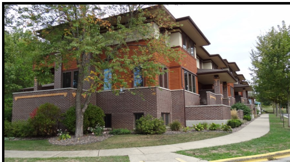
Two to three story multi-family buildings are good neighbors to single family residences.

Promote low-rise apartments in the Downtown District and in the Lifestyle District to provide access to services, shopping, and transit.