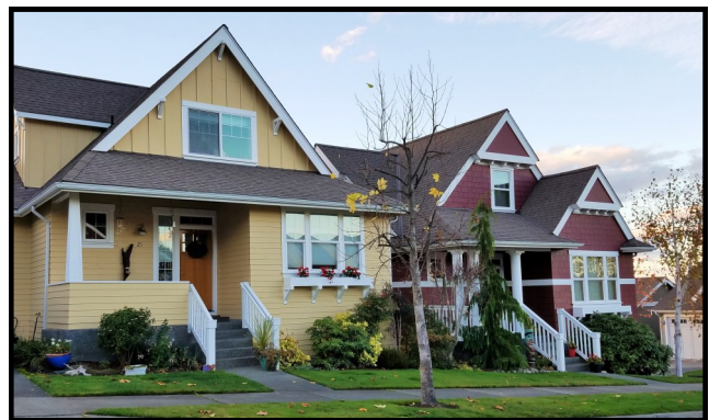
Typical-size houses on smaller lots—one of the new housing options for retirees in the Lifestyle District.

Part of the housing needs spectrum includes the opportunity to rejuvenate older neighborhoods through incremental redevelopment of properties that have outlived their current use, as well as remodeling existing homes. These opportunities are market-driven and reflect the cost of property acquisition and redevelopment versus the cost of new lots and new construction. Piecemeal efforts such as buying one low-value house within an older, central neighborhood are unlikely to attract financing or buyers – instead, a