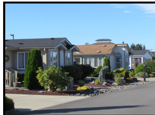
Manufactured homes can be an affordable housing option.

As the community changes, Sequim may encourage affordable housing in areas where there is a deficiency.