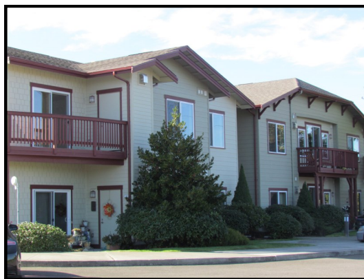
The condos at Sherwood Village are one of many housing options available for seniors at the complex.

Discussion: According to the Center for Housing Policy, nine out of ten adults wish to age in place. Seniors, on average, also spend a greater portion of income on housing. Sequim’s future includes options for senior citizens to remain in their home or to relocate within their neighborhood. Complete senior living complexes such as Sherwood Village offer a variety of housing options from fully self-sufficient homeowners to those needing full-time care. The Village and nearby medical facilities create the core of the Lifestyle District which is planned to grow geographically and fill in with additional housing types for senior living. Accessory dwelling units, co-housing, ADA-compliant home remodels, cottage housing, townhomes, and Universal Design projects are rare or non-existent in the city and expand options for independent living. Other options for seniors in-