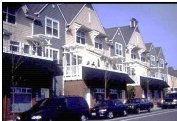
Live-work units with first floor businesses and residential living above.

Allow live-work units in Downtown to accommodate home ownership and commercial viability for shop owners and artists.