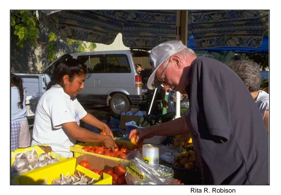
The Wenatchee Farmers Market offers local growers with small acreages the opportunity to sell produce directly to consumers.

commercial significance. However, counties should also consider conservation of those smaller farms that provide jobs and contribute to the economy in the rural area. Current use taxation, transfer or purchase of development rights, clustering, and other programs can provide incentives for