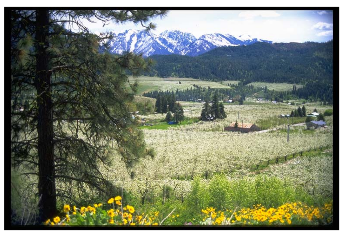
Washington State Apple Advertising Commission

Counties need to continue to be flexible and creative in how they reconcile existing development patterns and provide for future development in the rural area. They must balance the needs of rural residents with protection of those parts of the rural environment that contribute to every citizen's quality of life and economic and physical wellbeing.