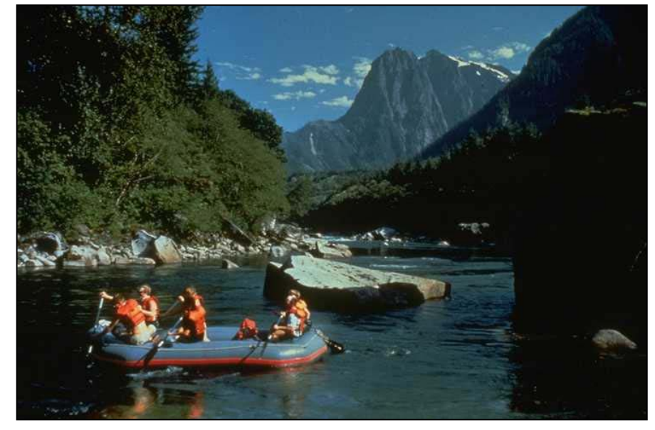
River rafting is a smallscale recreational business that may be appropriate in rural areas.