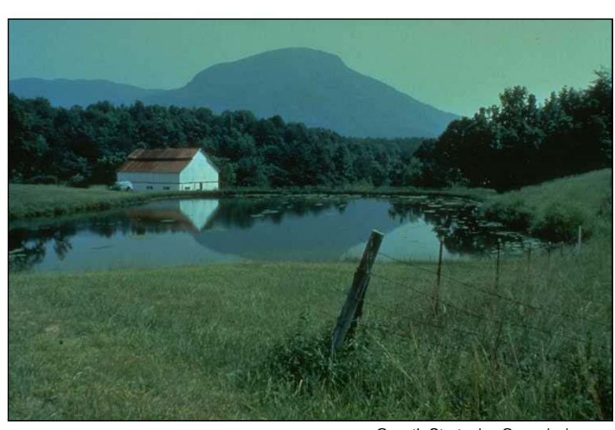
Growth Strategies Commission

Before beginning its rural planning, a county needs to have adopted a critical areas ordinance, including measures to protect wetlands.