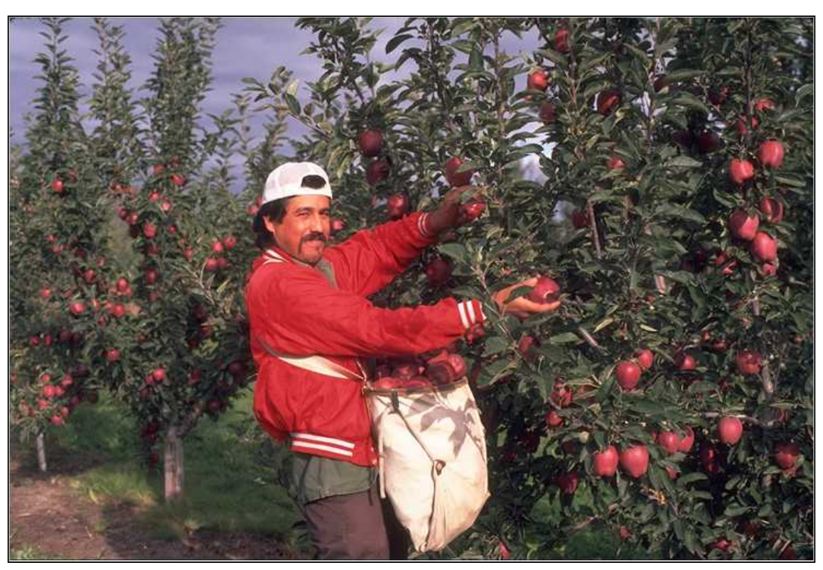
Washington State Apple Advertising Commission