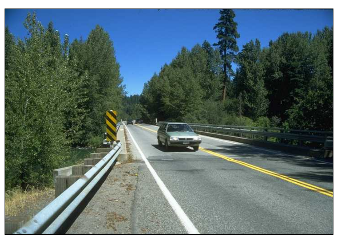
Rita R. Robison

Each community should adopt a functional classification system to group streets and roads according to the level