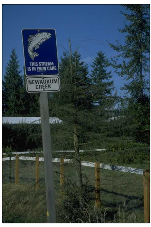
Rita R. Robisor

For example, shorelines deserve special consideration when determining rural