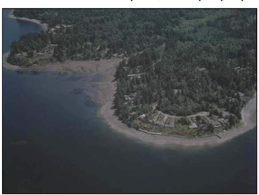
Thurston Regional Planning Council

Mapping critical areas, such as this Thurston County shoreline area, can help determine where dense development may or may not be appropriate in the rural area.