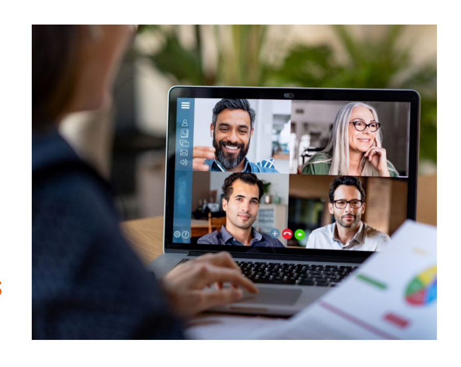
Hear from Chelan, Redmond, and Shoreline