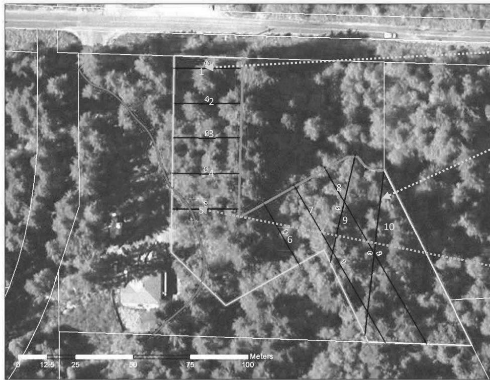
Figure 4. Ten transects created for Metric 2.

10 equidistant transects from the wetland boundary to the permit buffer, shown as black lines with yellow numbers.