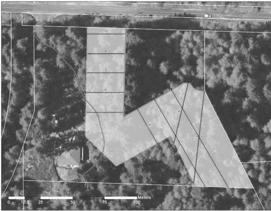
Blue-shaded area is the area of non-ecologically significant buffer (28 squares).