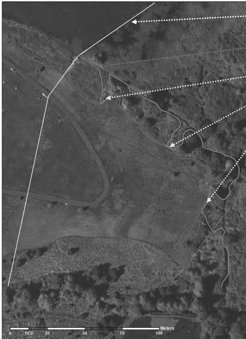
Figure 3. Example where Metric 1 is less than 100%, showing three areas where the non-ecologically significant buffer (mowed area) comes right to the edge of the wetland. This example was calculated using a map wheel. (Property is different from that shown in Figures 1 and 2.)

White parcel line obtained from county assessor web page