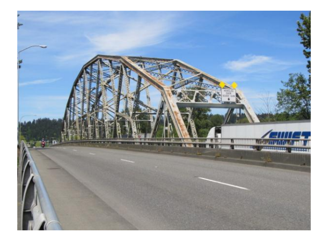
Newer bridge (#167/20W, foreground) and older (1925) bridge to northeast. 2011