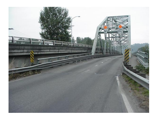
Deck view to north. 2011

Original portal braces prior to removal and replacement. 1947