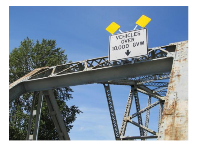
Replaced portal brace. 2011

Plaque on bridge showing M.M. Caldwell, designer, and Puget Sound Bridge & Dredging Co., Seattle, builder. 2011